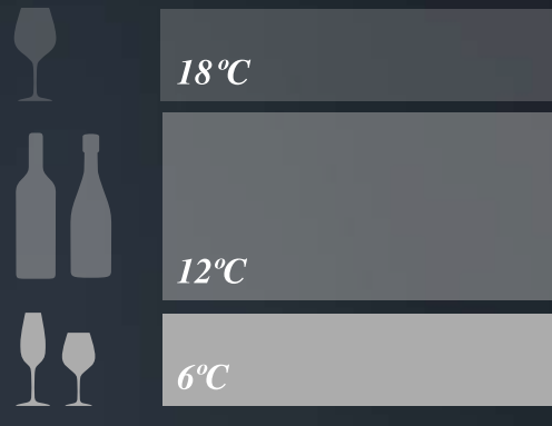
Three Temperature Zones